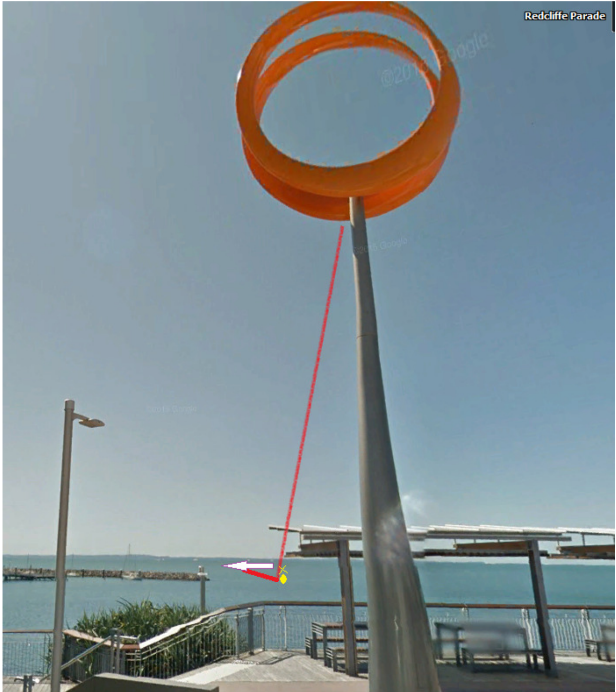
Picture of the Race 1 finish line transit shown from shore.

NOTE: The finish line will be to the east (seaward) of the yellow special mark. Boats will be approaching the finish line from the previous mark (Garnet Rock green buoy).